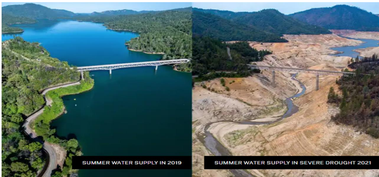
These photos show the effect severe drought has had on the summer water supply in Lake Oroville.

South Montebello Irrigation District (SMID) recognizes the substantial effort made by our community in conserving water since the last drought, but this is our new normal until the drought conditions change. Some of the easiest ways to conserve water is to wash full loads of laundry, turn off water when you are not actively using it (when brushing teeth), limit the amount of time you shower, fix water leaks within 2-3 days, and when you have the opportunity to upgrade your appliances choose water and energy efficient options. We will keep you informed throughout the year of any new updates or developments, please continue to conserve water and follow watering days and times for your property.